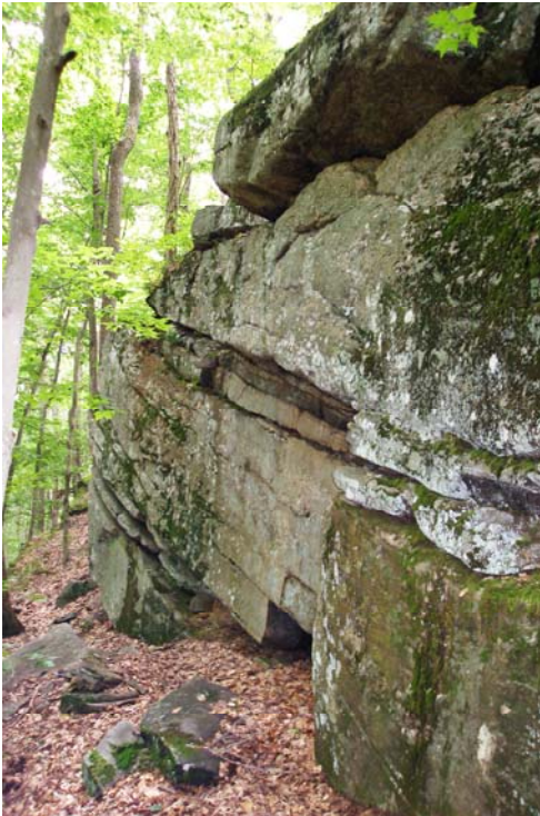
A 30' high section of exposed ledge

These trails explore streams that flow between three plateaus. Upland areas are also traversed. Traveling south from Trailhead 1, hikers become familiar with most of the common features of this trail system. Tall tulip trees are part of the mixed hardwoods along this eastern-most tributary of the Neck River. Ferns cover wet, rocky areas along the stream, while massive rocky outcrops provide shelter and den sites for mammals.