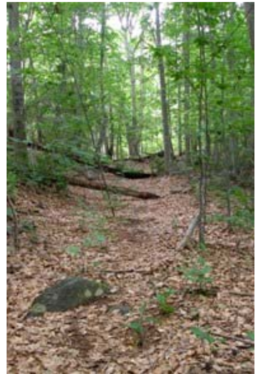
Looking uphill along the Durham Turnpike

Gradually, the height of the valley walls increase to some 50' on the left and 30' on the right. Layered rocky outcrops again frame the lowland. Moss covers boulders in the stream bed. Soon, the trail turns right up a slope to a narrow woods road. A right turn here leads back to the bottom of junction C. Turning downhill to the left, the valley continues to deepen. At the stream crossing, a broad, lush wetland lies to the right.