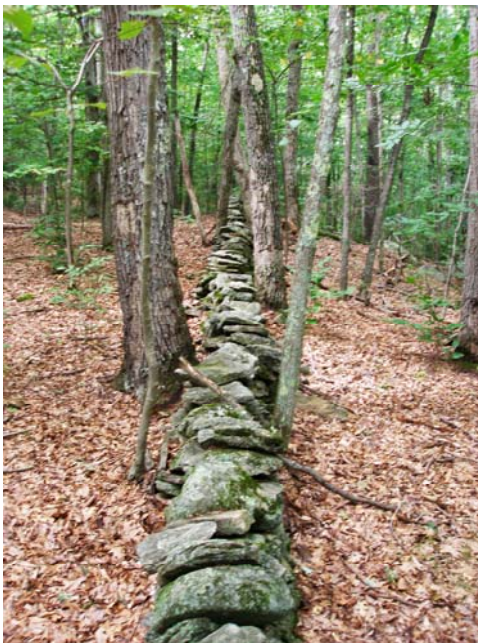
A linear stone wall

Here, the trail passes over exposed ledge. The wind blows along the track, keeping the trail clear of leaves so luxuriant moss can cover the surface. Some young hikers have named this section the Emerald Highway. A small loop trail, with a similar surface, branches off to the left before the trail reaches point G, its intersection with yet another moss covered woods road.