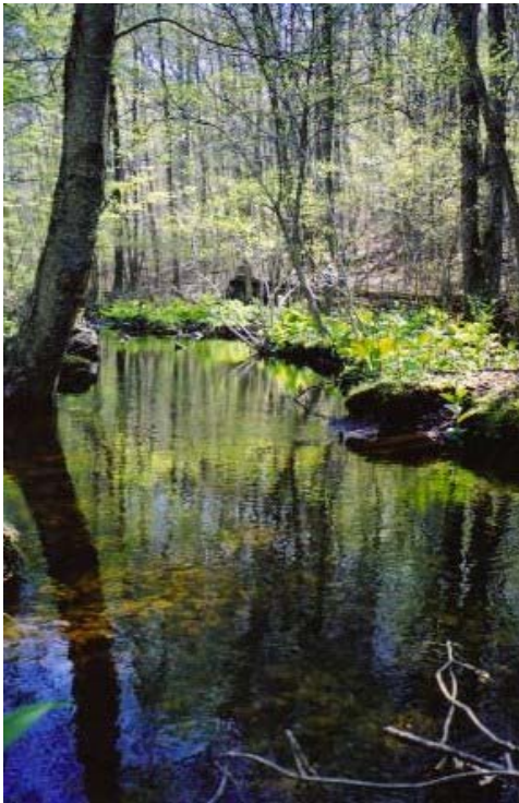
The Neck River south of Route 80

Initially, the trail follows an old woods road bounded on the left with stone walls. Almost immediately, the path takes a left turn to enter the section of woodland seen on the right. Here, piliated woodpeckers have made nearly rectangular holes in white pines. A number of large pines are found in this area.