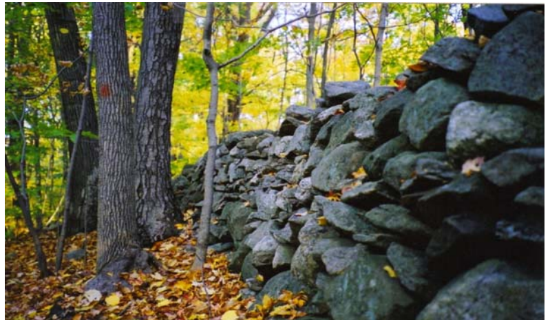
Magnificent stone walls define the Killingworth-Fair Haven Turnpike

A wire fence with cedar posts marks the western boundary of the preserve, Turning left, an open buffer provides an excellent route for the trail. At the end of the fence, turn left (east) to follow a broad woods road. As the trail descends, the sides of the road are built up with large boulders. Here, numerous beeches filter warm sunlight through to the path. Near the bottom of the hill, the trail again turns left (north) onto a lower area of the plateau. Soon, a right turn leads to a fairly steep downward slope where it intersects the beginning of the loop. Continuing downhill, the foot bridge over the Neck River is in view. Cross the bridge and backtrack along the trail to Trailhead 1.